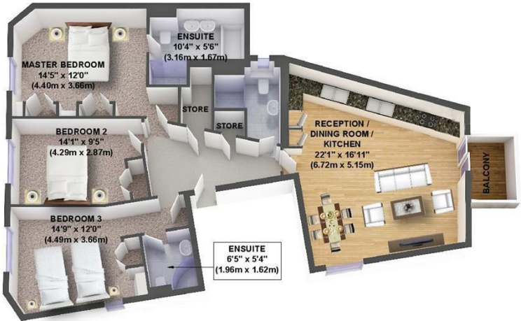
SECOND FLOOR GROSS INTERNAL FLOOR AREA 1137 SQ FT

Although every attempt has been made to ensure accuracy, all measurements are approximate and no responsibility is taken for any error, omission, or mid-statement. This floor plan is for illustrative purposes only and not to scale. Measured in accordance to RICS standards.